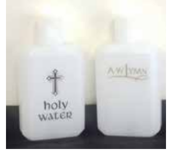
Each office will shortly receive a bottle of Holy Water.

Please make Holy Water available to Roman Catholic clients and anyone else requesting it. It should not be necessary to take the bottle out of the office excepting when a Priest is not available for, such as, burial of ashes or when cleansing a house.